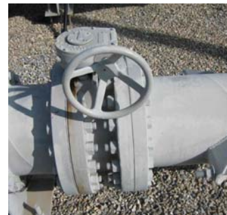
Failed Butterfly Valve

In 2008, Steve Crump of Crump Co., a Val-Matic Valve & Mfg. Corp. Representative, encountered problems at The Kern-Tulare Water District in Bakersfield, California. The Water District was experiencing a slamming tilted-disc check valve with a leaking oil dashpot and butterfly valve with a leaky seat. A Val-Matic competitor's tilting-disc check valve consistently slammed at pump start up and its top mounted dashpot was leaking oil. Around the same time, a different competitor's Butterfly Valve seat began leaking.