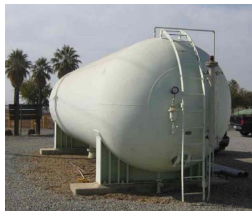
Hydropneumatic Surge Tank

In order to measure the system dynamics, Val-Matic's Vice President of Engineering, John Ballun, visited the site to investigate the slamming problem. A high-speed pressure transducer was installed on the downstream pipe elbow. The transducer was connected through a USB interface module to a laptop and set with a window trigger of 20.8/0.4 psig, a data period of 0.025 sec., and 5,000 readings (125 sec). After the pumps were running they were intentionally tripped to simulate the on/off operation of the pumping systems so the pressure transients could be recorded. At this time a loud slam was heard and simultaneously water sprayed out of the well-service air valve in the line.