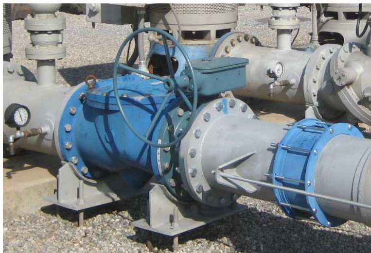
Val-Matic Surgebuster® HD and Val-Matic American-BFV® Butterfly Valve installed

The original Butterfly valve was replaced by the Val-Matic American-BFV® Butterfly valve which eliminated the leakage. Val-Matic's Butterfly valve features the Tri-Loc system, which allows for easy seat adjustment and or replacement using only a socket wrench - no hypodermic needles or epoxies required. Val-Matic Valve & Mfg. Corp.'s product line keeps your applications running smoothly by offering superior valves at an affordable price.