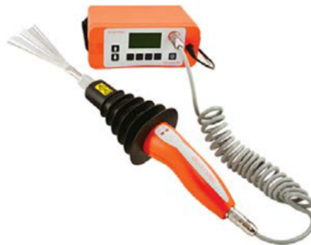
Figure 4. Typical High-Voltage Holiday Test Equipment

After either coating process, all parts are visually examined to ensure adequate coverage and the dry film thickness is measured in random locations. When required by the purchaser, a holiday test is conducted to identify any voids in the coating in accordance with ASTM G62. In a holiday test, a voltage is applied over the coated surfaces and any continuity between the test wand and substrate surface will be indicated on the detector unit. Epoxy coatings less than 20 mils in thickness can be checked using a low-voltage (i.e. 22.5 to 80 volts) test unit while thicker coatings require the use of high voltage test unit in the range of 500 to 10,000 volts, depending on the thickness of the coating. When voids are identified, the coating is repaired and retested.