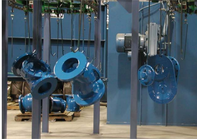
FIGURE 3. Conveyor System for Fusion Bonded Epoxy Process.

After either coating process, all parts are visually examined to ensure adequate coverage and the dry film thickness is measured in random locations. When required by the purchaser, a holiday test is conducted to identify any voids in the coating in accordance with ASTM G62. In a holiday test, a voltage is applied over the coated surfaces and any continuity between the test wand and substrate surface will be indicated on the detector unit. Epoxy coatings less than 20 mils in thickness can be checked using a low-voltage (i.e. 22.5 to 80 volts) test unit while thicker coatings require the use of high voltage test unit in the range of 500 to 10,000 volts, depending on the thickness of the coating. When voids are identified, the coating is repaired and retested.