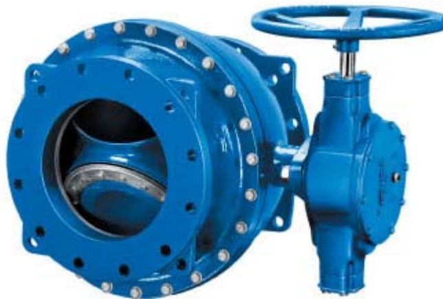
FIGURE 1: Quarter-Turn AWWA C507 Ball Valve with FBE

Another driving force for the use of advanced epoxy coatings was environmental concerns. U.S. valve manufacturers must not only comply with air emission requirements but are also actively engaged in activities that help mitigate the effects of climate change. Coating processes for valves have migrated from solvent-based coatings to epoxy coatings with high solids content to reduce volatile organic compounds (VOC's), which are a serious air pollutant. Similarly, powder-based coatings such as fusion bonded epoxy produce no VOC's.