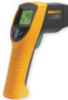
FIGURE 2. Infrared Thermometer with Laser Sight.

Liquid epoxy is furnished as a two-part kit that is thoroughly mixed and applied to the valve surfaces by spray, brush, or roller taking care to vent the vapors to promote the removal of the solvents from the coating. Because of the solvents involved, there is typically a limitation to the thickness of a single coat, such as 16 mils. If a greater thickness is required, additional coats are applied within a prescribed coating window. The mixture also has a finite pot life of 3-5 hours depending on temperature and humidity conditions. Dry time for handling is typically 7 to 10 hours, but water immersion may require 5-10 days of additional cure time.