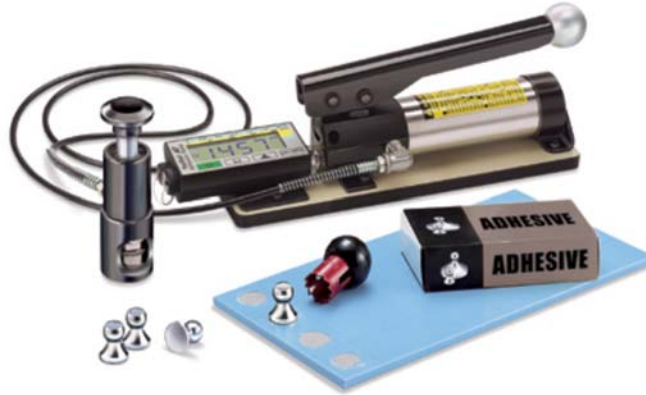
FIGURE 5. ASTM D5451 Adhesion Testing Equipment

met by liquid epoxies, but is not typically reported quantitatively. Fusion bonded epoxy coatings typically have twice the impact strength and can be as high as 160 in- lbs. The adhesion strength is also rarely published for liquid epoxies but has been measured to be in the 1000 to 3000 psi range when good surface preparation practices are followed. In general, fusion bonded epoxy coatings exhibit twice the adhesion strength in the range of 3000 to 6000 psi (Val-Matic, 2013). Figure 5 illustrates the equipment used to perform the adhesion test.